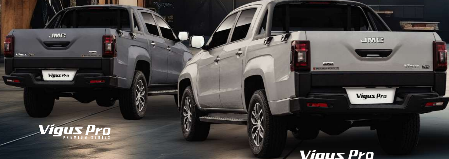
Vigus Pro PREMIUM SERIES

This tough and reliable workhorse with its dynamic unique exterior styling and premium interior is meticulously crafted for business owners seeking durability and performance. The Vigus Pro ensures maximum value for seamless driving, making it your ultimate companion for business success.