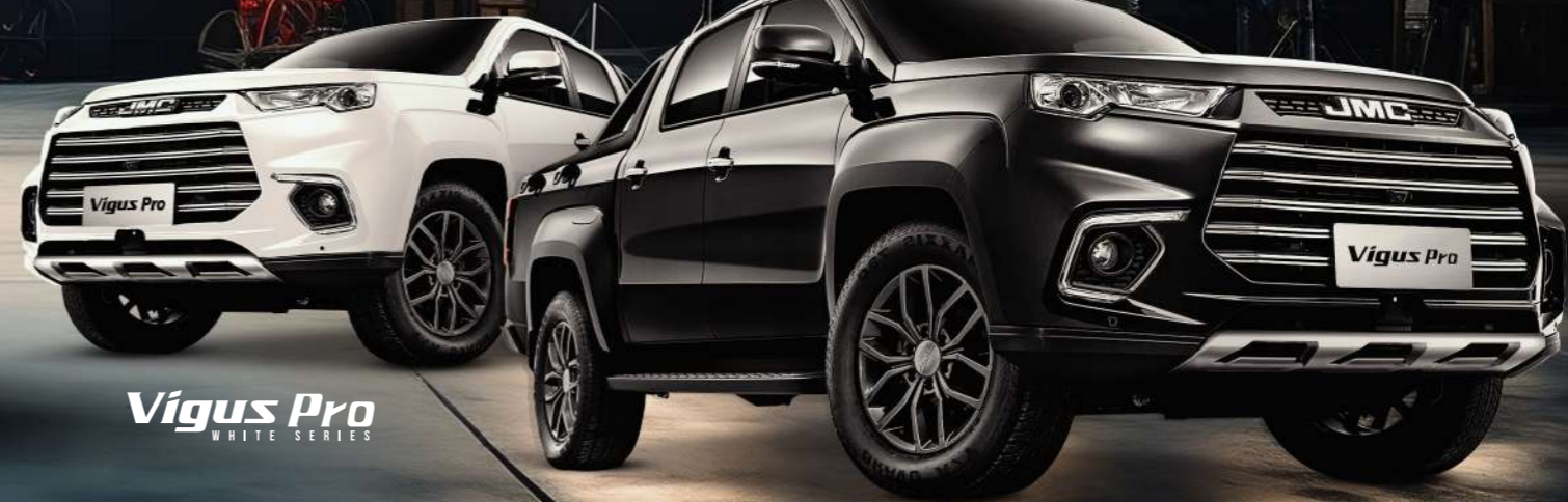
Vigus Pro WHITE SERIES