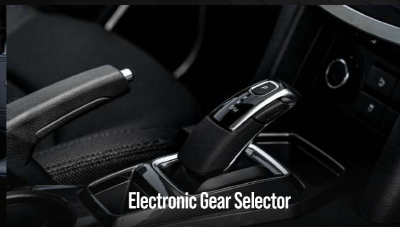
Electronic Gear Selector

The touchscreen centre console is the hub for your entertainment needs on-the-go, with a USB Port to connect or charge your device. The reverse camera is also integrated to display visuals for smarter parking.