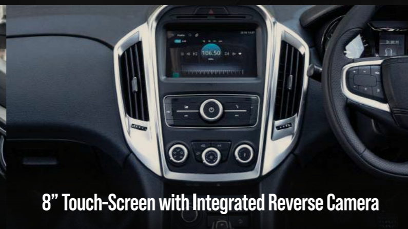
8" Touch-Screen with Integrated Reverse Camera

The leather steering wheel enables an easy operation for menu selection & Bluetooth connection while the paddle shifter allows you to change gears while maintaining hands on wheel for a more engaging driving experience.