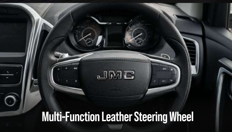
Multi-Function Leather Steering Wheel

The leather steering wheel enables an easy operation for menu selection & Bluetooth connection while the paddle shifter allows you to change gears while maintaining hands on wheel for a more engaging driving experience.