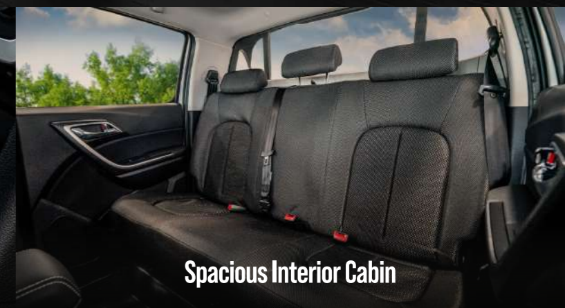
Spacious Interior Cabin

The shift knob features a modern design and allows gear changing with a simple press of a button, reducing the arm movements.